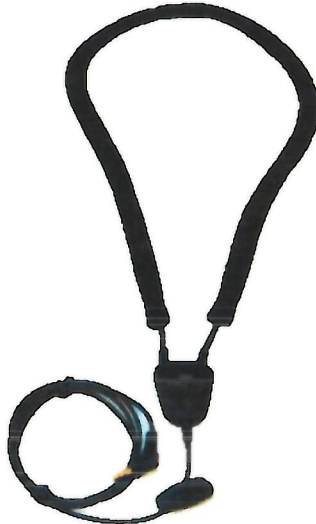
Peltor TEP-LOOP-200 Neck Loop