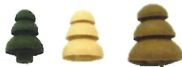
3M UltraFit Eartips

This document is issued by the Company under its General Conditions of Service accessible at http://www.sgs.com/terms_and_conditions.htm . Attention is drawn to the limitation of liability, indemnification and jurisdiction issues defined therein.