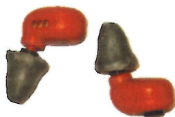
3M™ PELTOR™ Electronic Earplug, EEP-100 EU OR