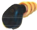
3M™ PELTOR™ Tactical Earplug, TEP-200 EU