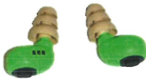
3M™ PELTOR™ Electronic Earplug, EEP-100 EU