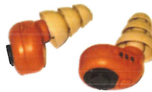
3M™ PELTOR™ Level Dependent Earplug, LEP-200 EU OR